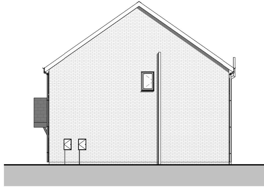
Side Elevation 1 : 100